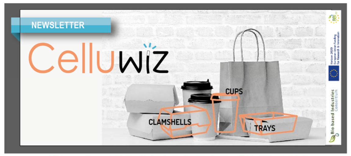
This project has received funding from the Bio Based Industries Joint Undertaking under the European Union's Horizon 2020 research and innovation programme under grant agreement No 745718